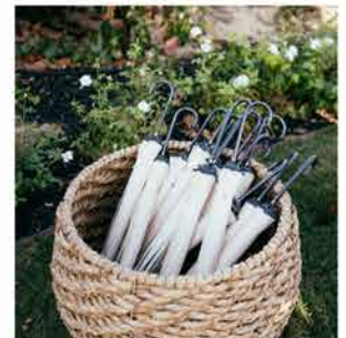
XL Baskets $35 each