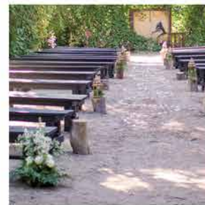
10ft Solid Wood Benches $60 Each