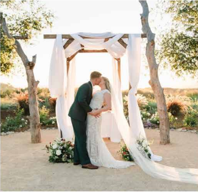
Chuppa $390 Linen not Included