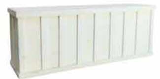
8ft White Bar Shelving underneath $350