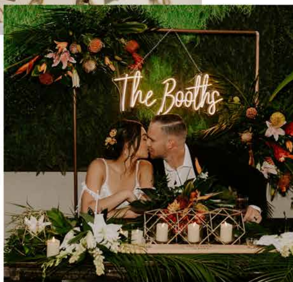
Copper 6ft by 4ft Backdrop (clients hang seating charts off of this or signage) $70