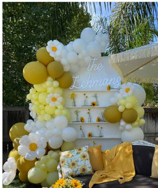
8ft by 4ft shelved wall $199