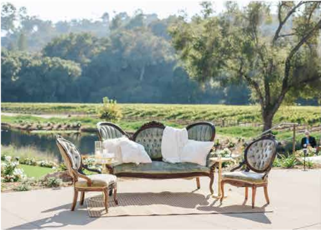
Vintage Sage Lounge $650

All Lounge sets are mix & match: sets include a couch, rug, two side chairs, throw pillows, coffee table or side tables, and table decor