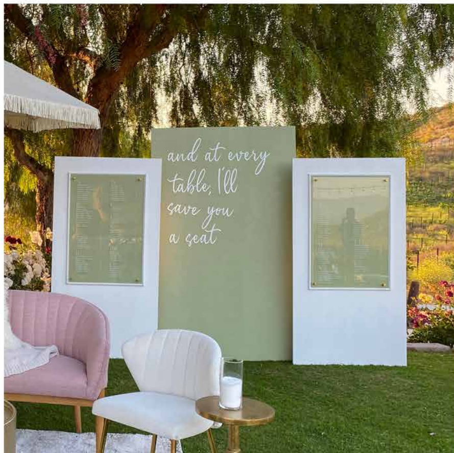
Sage Seating Chart 7ft by 4ft center Two side pannels 6ft by 3 1/2 ft $320