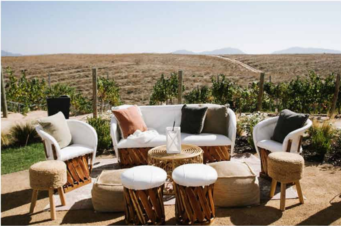
Hacienda Leather Lounge $890