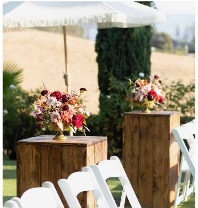
Natural Wood Floral Boxes 3ft $80 ach