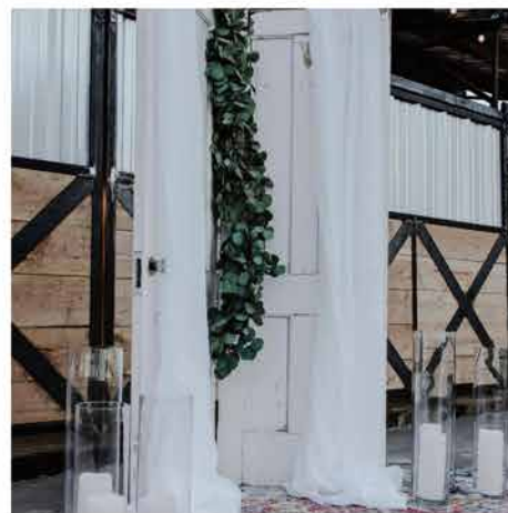
Vintage Double Doors $150