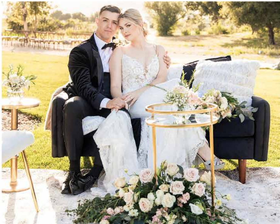
Modern Black Velvet $650