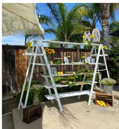
Ladder Shelves $150