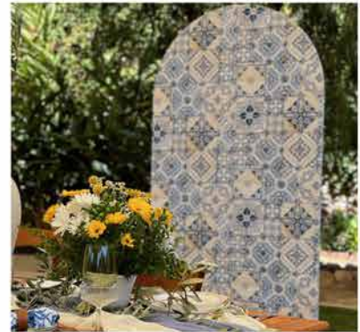
Mediterranean Tile Backdrop $180