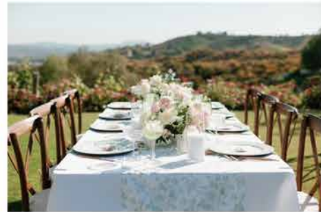
Queens Banquet Tables 8 ft by 40 inch $60