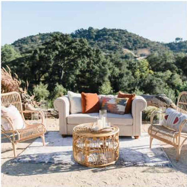
Coastal Set $650