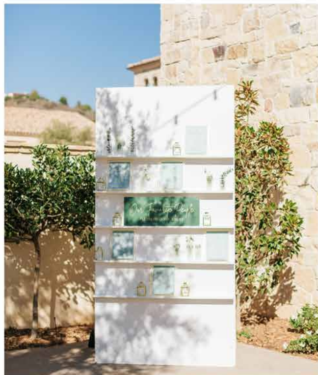
8ft by 4ft shelved wall $199