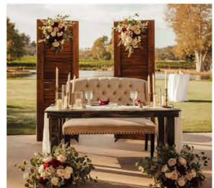
Louver Doors $150 Set