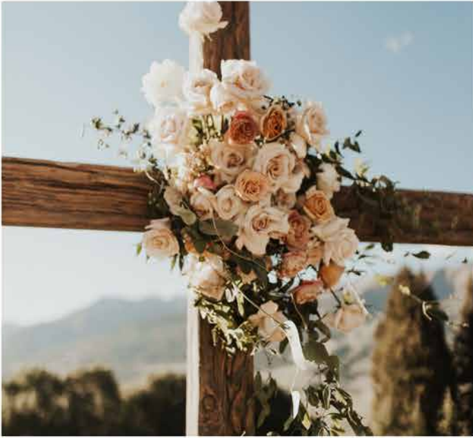
Wood Cross $220