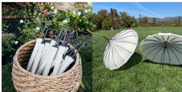
French Style Canvas Umbrellas in Basket display $125