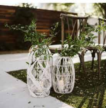
Woven Basket Lanterns $25