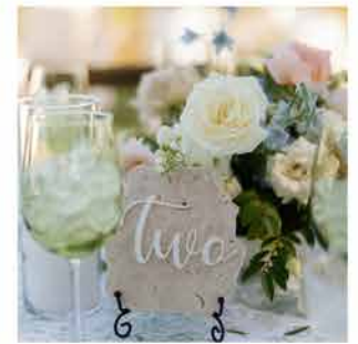
Table Numbers $35