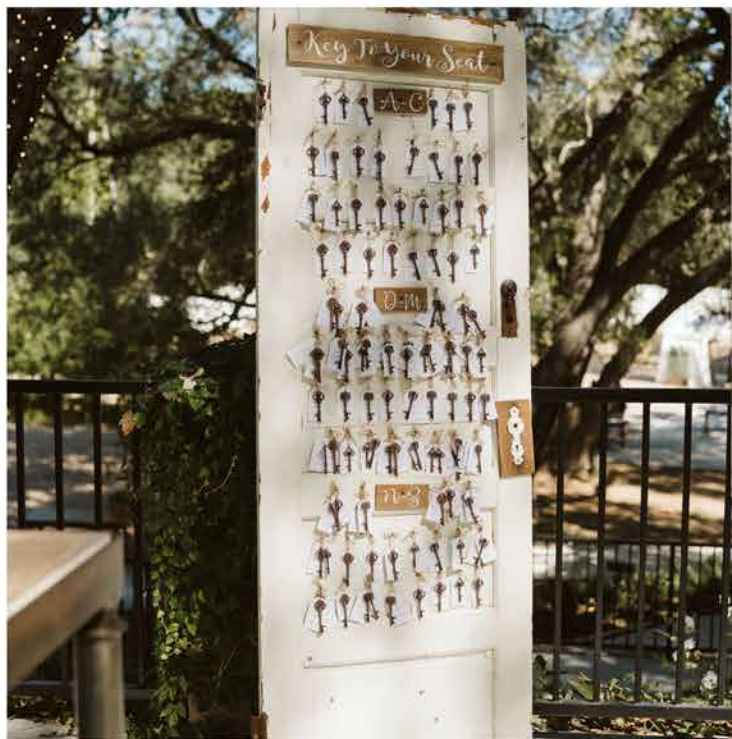
Vintage Door "Key to your seat" $150