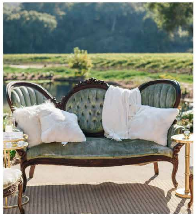
Sage Velvert/Wood Vintage Couch $450