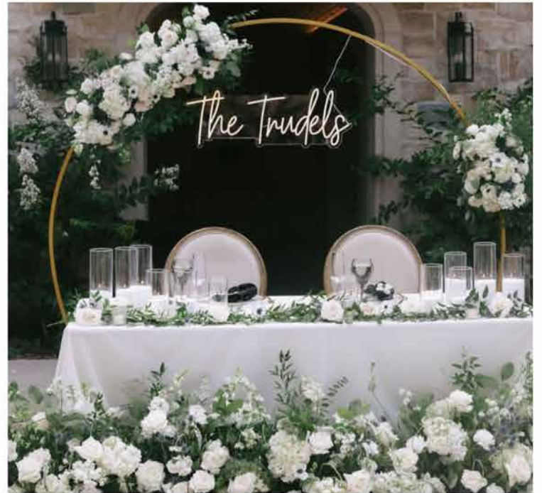
Circle Arch $180