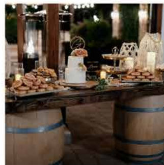
8ft Wine Barrel Table/Bar (common) $220