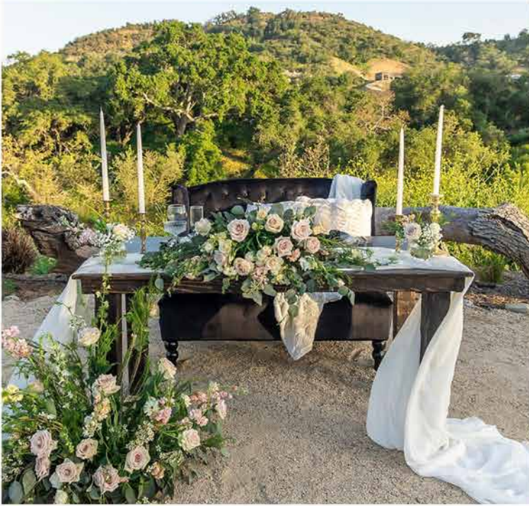
Black Setee $150