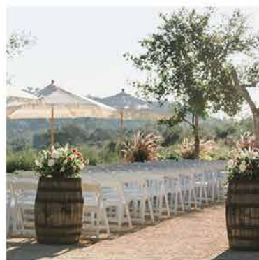
Ceremony Umbrellas $80 (includes base) Wine Barrels $60