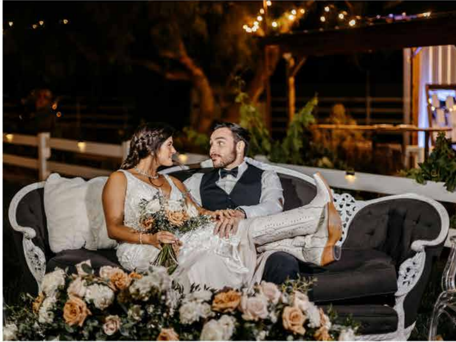
Charcoal Vintage Lounge Set $650