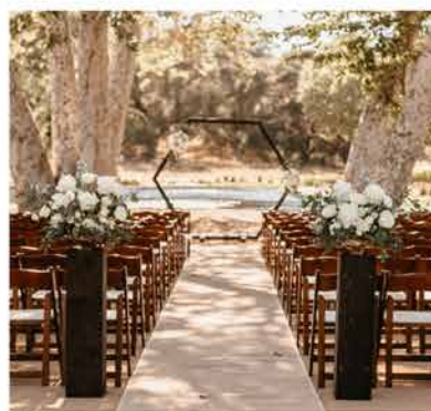
Wood Floral Riders $50