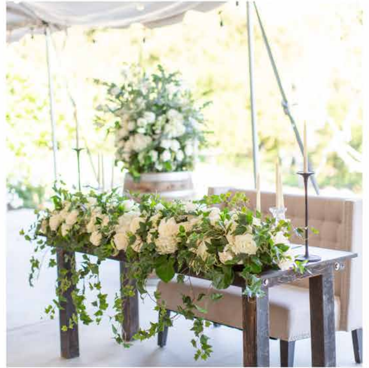
Ivory Squared Edges setee $150