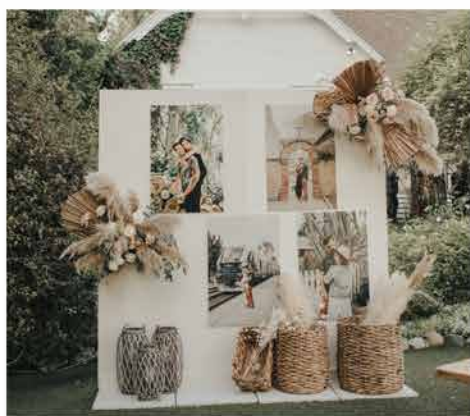
8ft by 8ft White Photo Display Wall $280