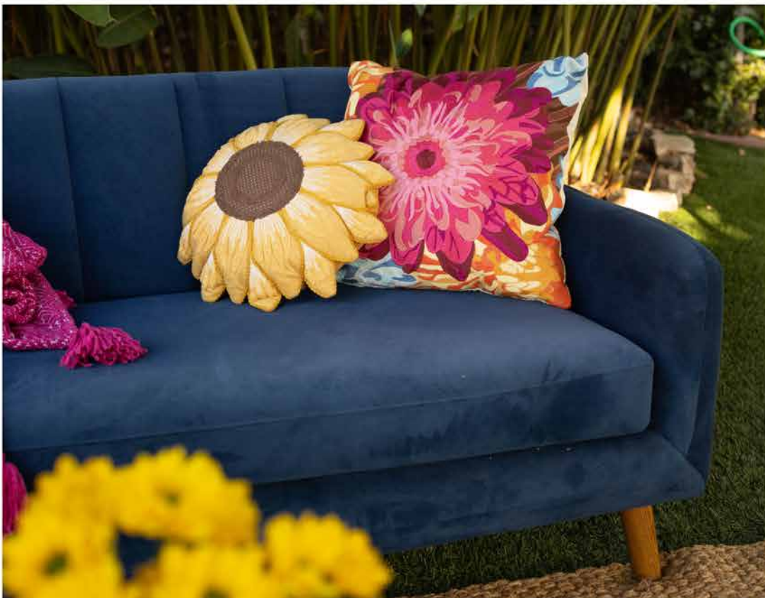
Navy Blue Lounge Set $650