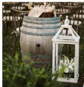
Wine Barrels $60 White 3ft Open Lantern $40