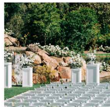
Floral Stands 3ft $80, 4ft $90