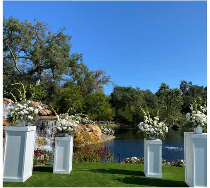
White Floral Boxes 3ft $80 Each 4ft $90 Each