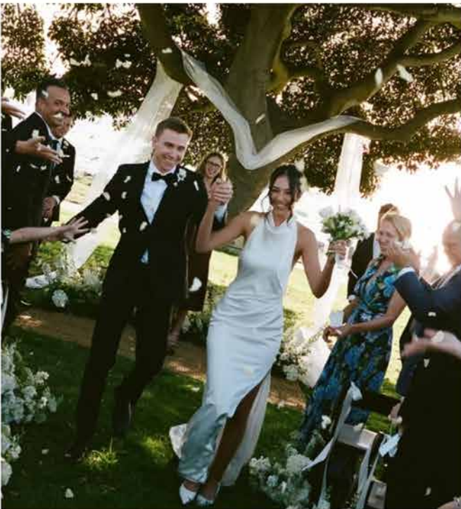
Ceremony Tree Draping $150