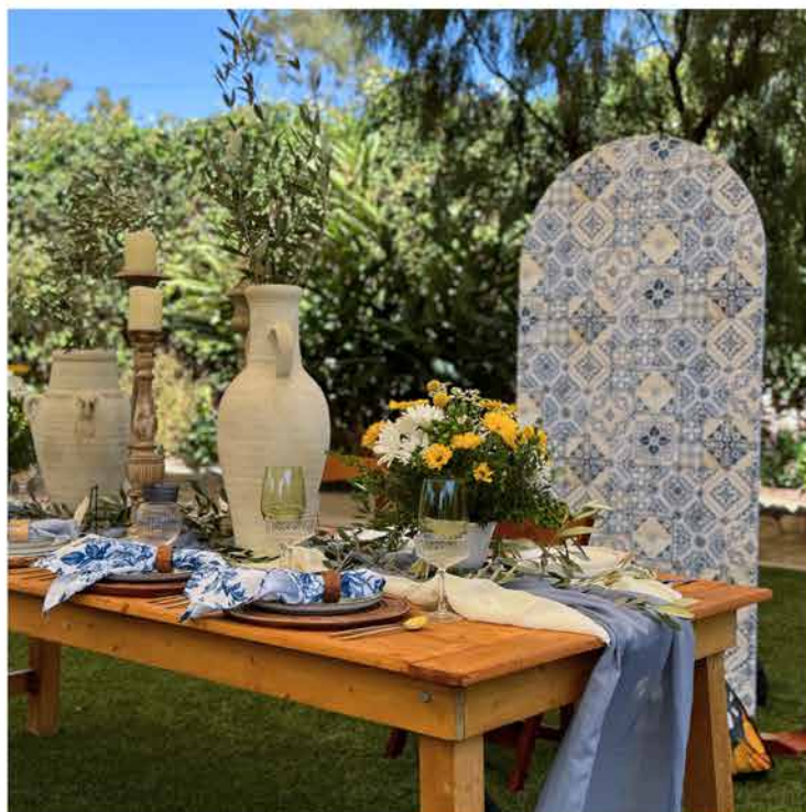
7ft Mediterranean Backdrop $199